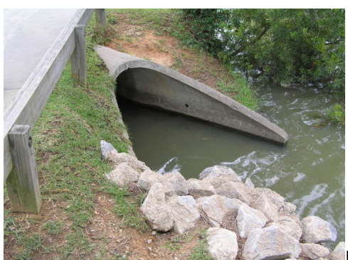
Use Pipe Flared End Section when specified in the